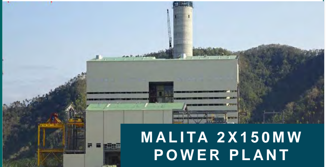
MALITA 2X150MW POWER PLANT