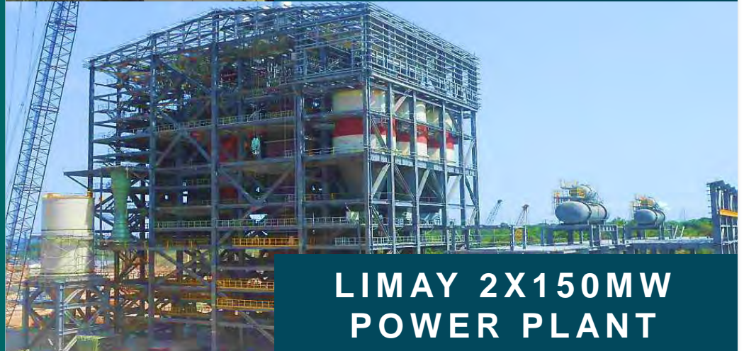
LIMAY 2X150MW POWER PLANT